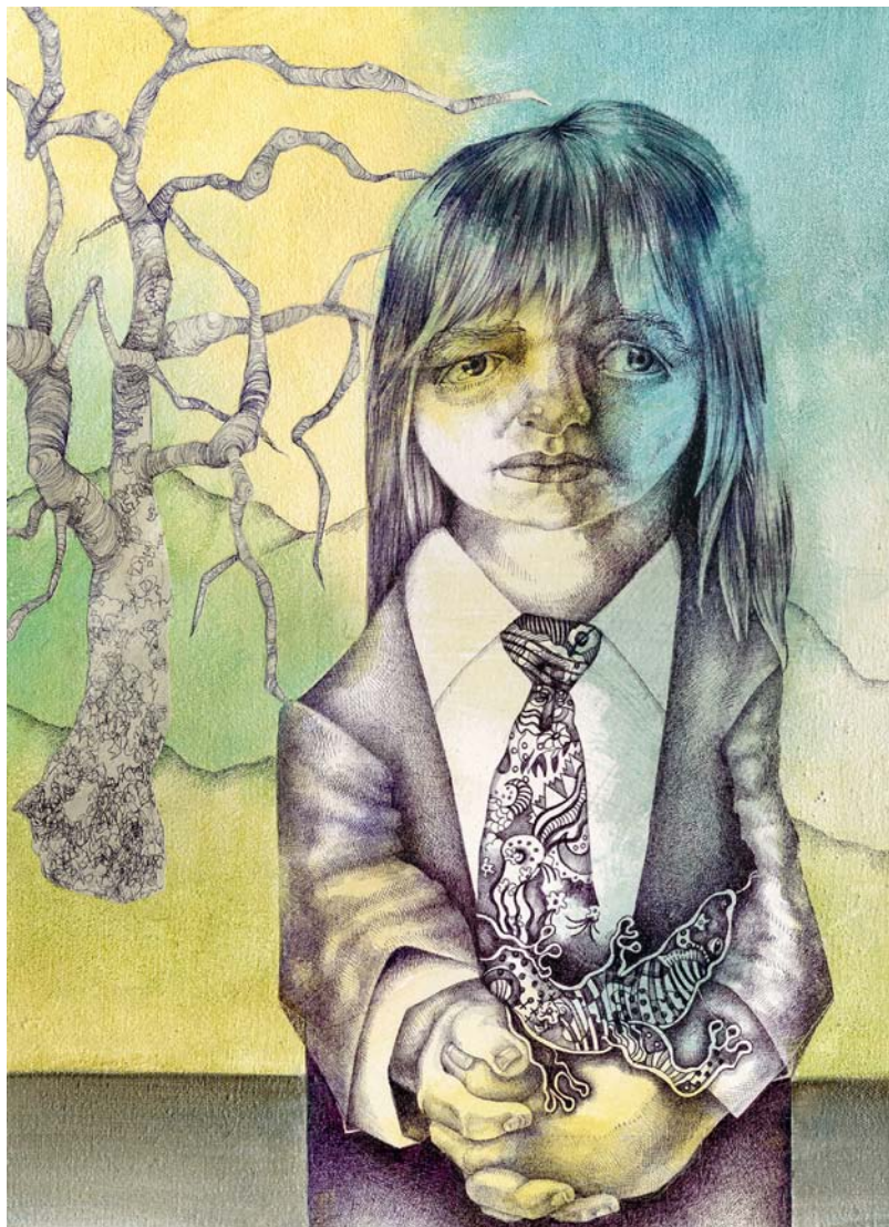
Normal, OK: Lawton Amarillo Acrylic, ink and collage on canvas, 12 x 16 in, 2006