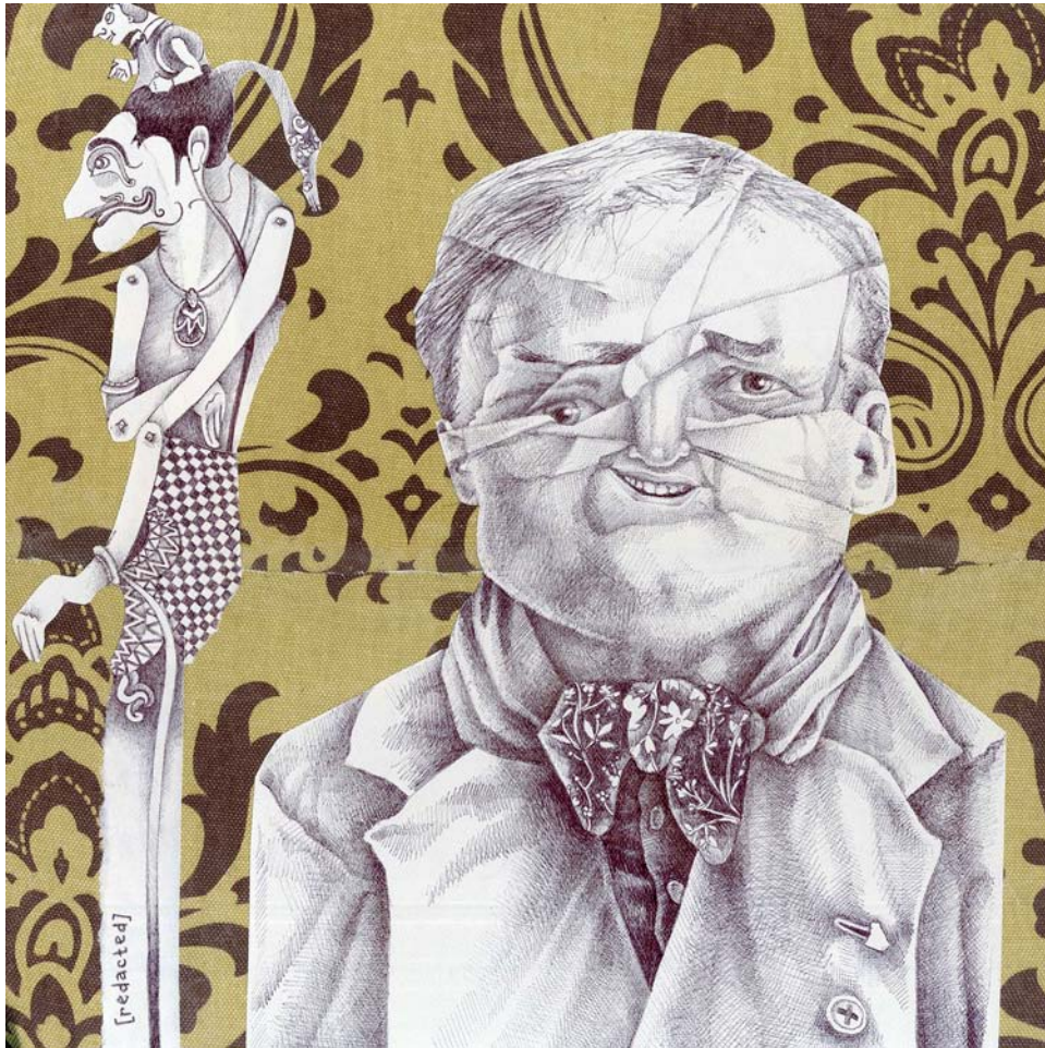
Normal, OK: Hinton Geary [redacted] Ink and collage on found fabric, 12 x 12 in, 2007 Included in the Society of Illustrators 51st Annual Book and Exhibition

previous page: Pernell Foster Acrylic on Rives BFK, 11 x 12 in, 2008