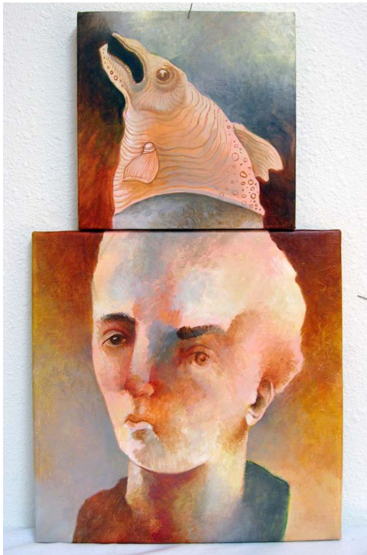
Faye (Runs Hot and Cold) Acrylic on canvas, approximately 9 x 14 in, 2008