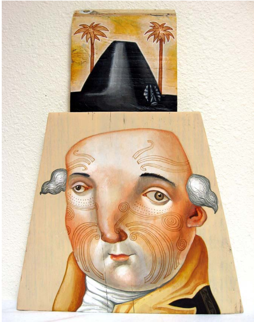
In General Acrylic on found wood, approximately 10 x 16 in, 2008