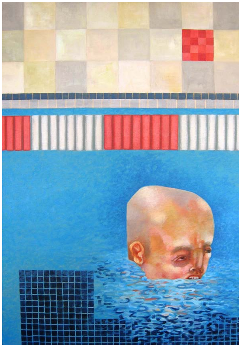
Submerge Acrylic on canvas, 18 x 24 in, 2009