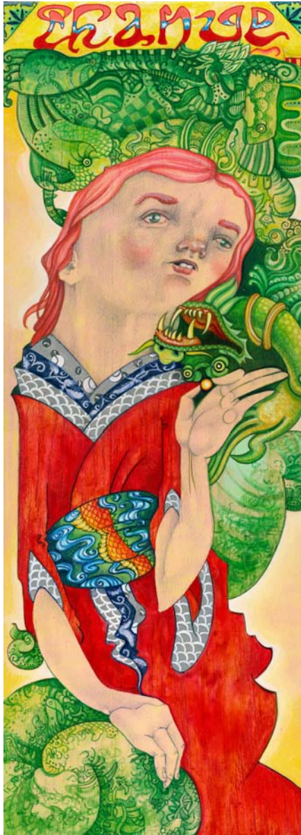
Sister Station Acrylic and graphite on wood, 8 x 22 in, 2006