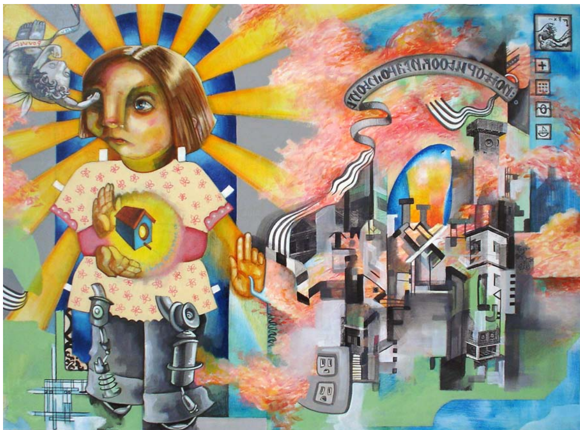
Birdhouse (In Your Soul) Acrylic and collage on masonite, 14.5 x 19 in, 2007