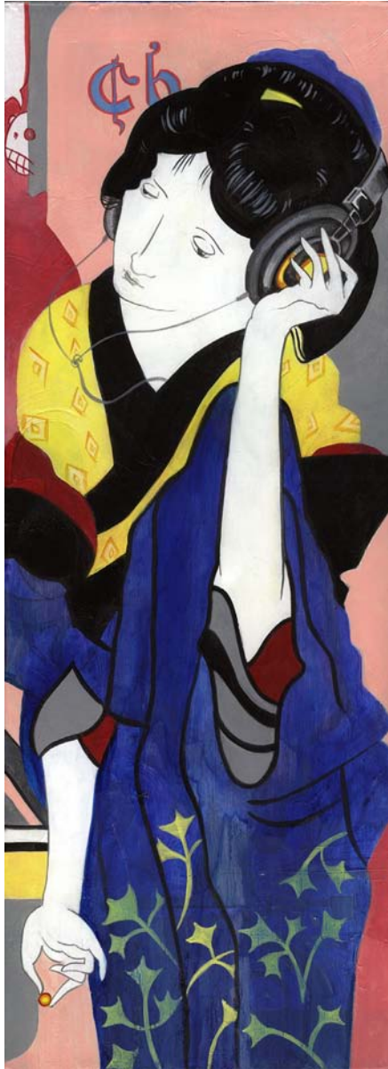
Sister Sister Station Acrylic and graphite on wood, 8 x 22 in, 2006